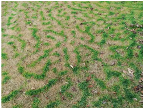
Bermudagrass after a hard first freeze

With fall firmly entrenched and winter right around the corner now, bermudagrass and zoysiagrass are turning brown and slowing down their growth. As soon as we see our first good freeze, the turf will turn totally brown, often with a wavy pattern of green and brown stripes running through the turf. The good news is that if you've not done so yet, one more good mowing should be it for the season, and you can put your mower to